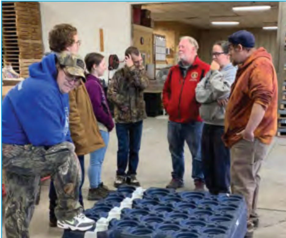
Workshop services include contracts with individual businesses which include everything from small local firms to national corporations.

It’s a formula that is a proven winner for Missouri and Missourians.